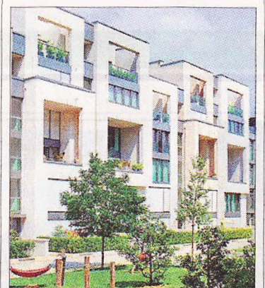
Eastern blocks: Prenzlauer Berg is attracting young professionals

'It's like being in New York. It's bombastic, full of energy and history'