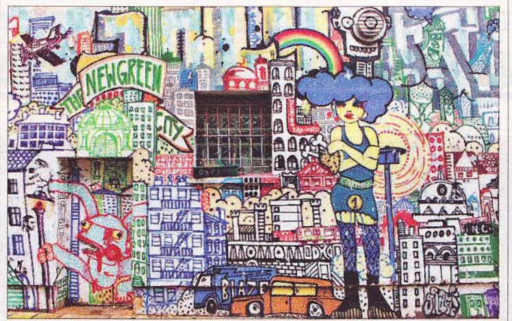
Writing's on the wall: property in Berlin's edgy east is in demand

medieval city wall. Star design and architectural brands are also muscling in on Mitte. Philippe Starck is already in town with Yoo Berlin (yooberlin. com, penthouses for sale at €27.000 per sq m (£19,725). Berlin's highest price to date). Daniel Libeskind's architectural statement Sapphire will house 70 apartments from €210,060 (£153,478) at the northern end of Chausseestrasse. And Frank Gehry is set to design the first high-rise residence of the Kollhoff master plan at Alexander Platz.